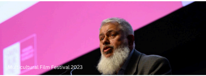
Multicultural Film Festival 2023