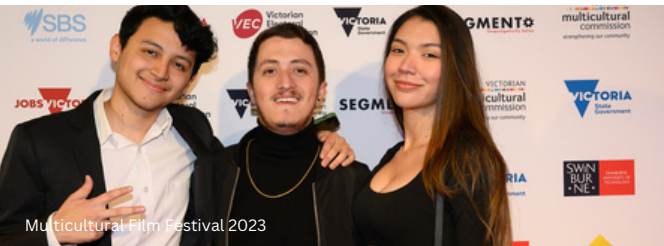
Multicultural Film Festival 2023