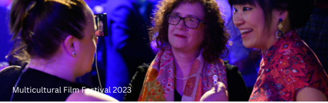
Multicultural Film Festival 2023