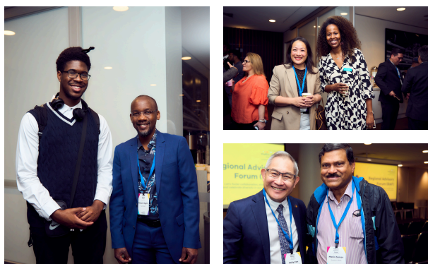
Regional Advisory Forum 2023