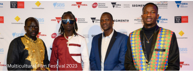
Multicultural Film Festival 2023