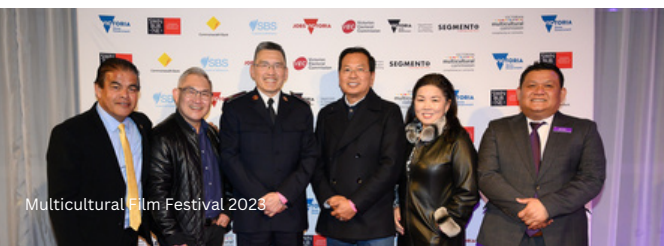
Multicultural Film Festival 2023