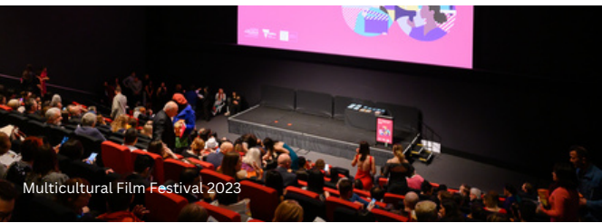
Multicultural Film Festival 2023