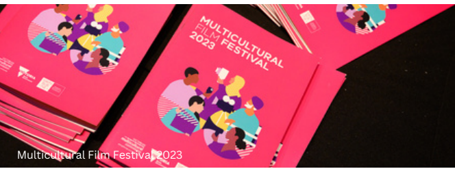
Multicultural Film Festival 2023