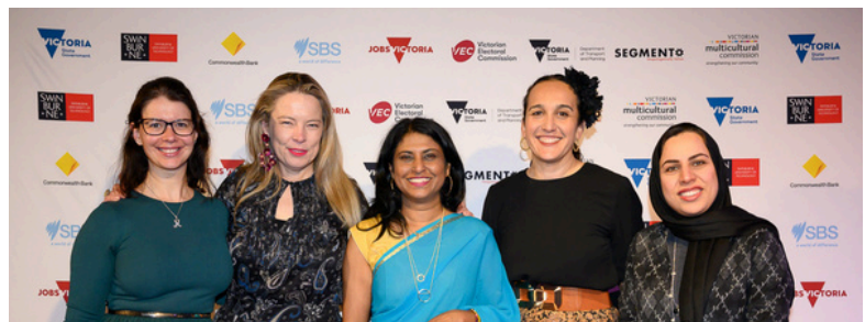
Multicultural Film Festival 2023